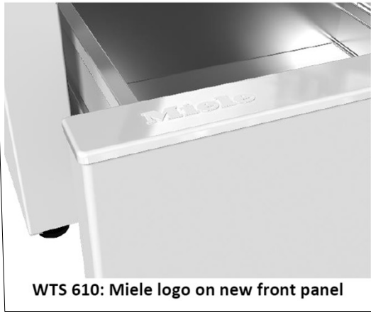
WTS 610: Miele logo on new front panel