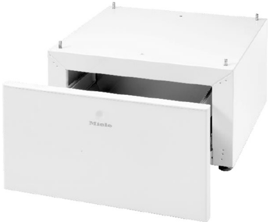
Current WTS 510

The Miele logo is no longer located on the front of the drawer but is now integrated into the top of the front. In addition, the front gap between the appliance and the plinth panel has been optimized to create an even more harmonious appearance. Overall dimensions and installation/attachment to the laundry appliances has not changed.