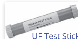
UF Test Stick

Order additional components as separate line items.