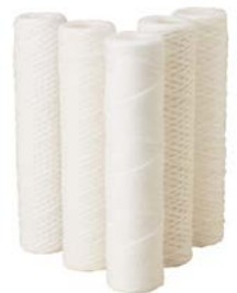
WP String Wound