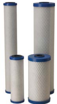
EPM & EP Carbon Block