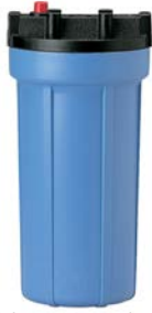
Slim Line Housing #10