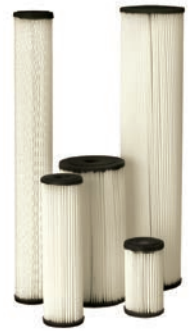
Reusable Pleated Polyester