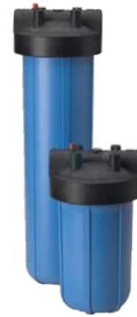
Big Blue Housings