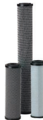
C1 Impregnated Cellulose