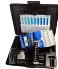
Chemetrics Sulfide Test Kit