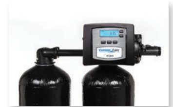
UF Twin Series

When Ordering: Provide the appropriate Code listed below for each Option Field. If not provided, the Standard option will be shipped. See Page 5.