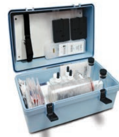
Deluxe Test Kit