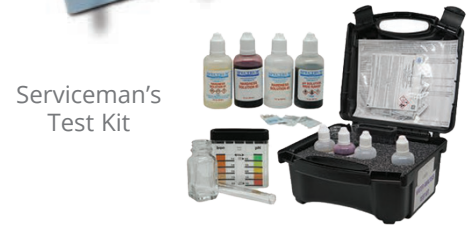
Serviceman's Test Kit