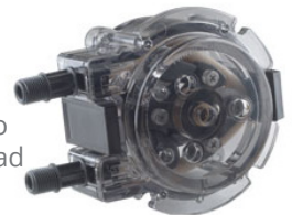
QuickPro Pump Head