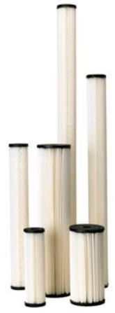
S1 Pleated Cellulose