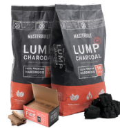
MB20203221 Fuel Bundle