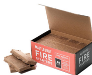
MB20091521 Min Buy = 1 Case