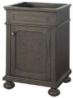
Oakhurst 1536-V24 TQ-R2522CM8 S-100WH 1536-M24 $ 595.00 ONLY 4 AVAILABLE