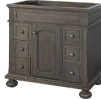
Oakhurst 1536-V36 TQ-R3722CM8 S-100WH 1536-M28 $ 890.00 ONLY 12 AVAILABLE