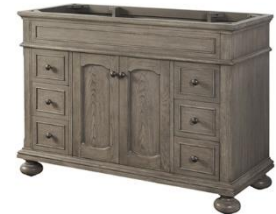
Oakhurst 1535-V48 TQ-R4922CM8 S-100WH 1535-M28 $ 1052.50 ONLY 3 AVAILABLE