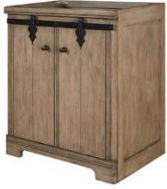
Homestead 1526-V30 T3-S3022BA S-200WH $ 638.75 ONLY 6 AVAILABLE