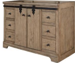
Homestead 1526-V48 T-4922BA S-100WH $ 992.50 ONLY 7 AVAILABLE