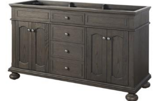
Oakhurst 1536-V6021D TQ-R6122DCM8 S-100WH (2) 1536-M24 (2) $ 1437.50 ONLY 2 AVAILABLE