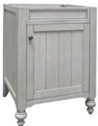
Crosswinds 1524-V24 TQ-R2522EG8 S-100WH 1524-MC24 $ 612.50 ONLY 4 AVAILABLE

Offer valid for single purchase order – orders may not be combined or added to once submitted to Fairmont Designs