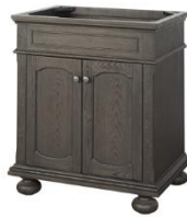
Oakhurst 1536-V30 TQ-R3122CM8 S-100WH 1536-M24 $ 687.50 ONLY 10 AVAILABLE