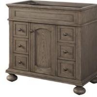
Oakhurst 1535-V36 TQ-R3722CM8 S-100WH 1535-M28 $ 890.00 ONLY 5 AVAILABLE