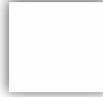
WM White Matte

Guildstone White Matte Edge Profile Size Flush/Overhang Faucet Holes Sink