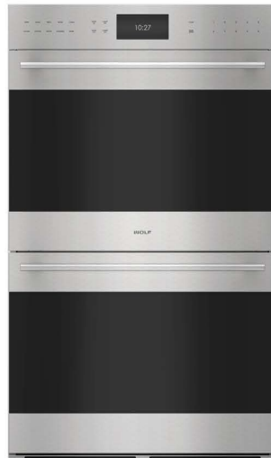
DO3050TE/S/T W 29 7 / 8 " x H 50 7 / 8 " x D 23"