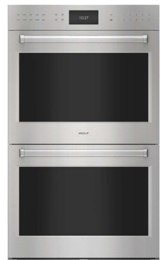
DO3050PE/S/P W 29 7 / 8 " x H 50 7 / 8 " x D 23"