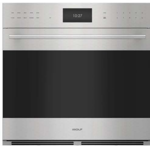
SO3050TE/S/T W 29 7 / 8 " x H 28 1 / 2 " x D 23"