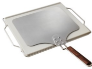
Bake Stone Kit 9016997 - $230 Value

+ ONE Accessory Option: Accessorize your new oven by choosing one of the following items as our gift to help you make the most out of your meals while cooking with style.