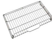
Full-Extension Ball-Bearing Rack 829241 - $170 Value