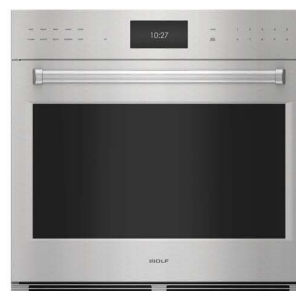
SO3050PE/S/P W 29 7 / 8 " x H 28 1 / 2 " x D 23"