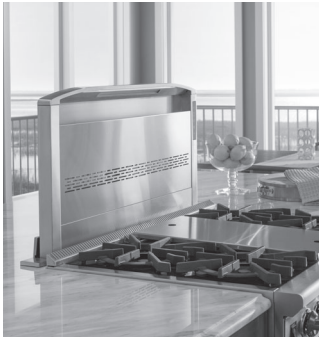
Stainless Steel Finish