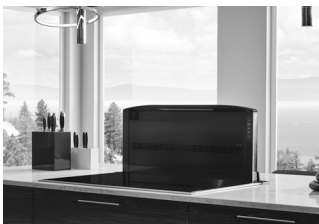
Black Stainless Steel