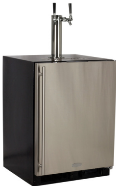
Tap not included