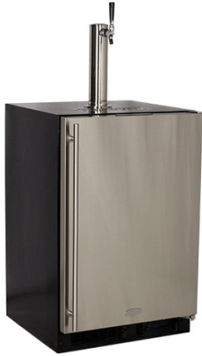
Tap not included