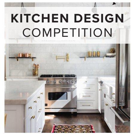
2021 VIKING DESIGN COMPETITION Winners will receive global recognition and prizes. VIKINGRANGE.COM/DESIGNERS