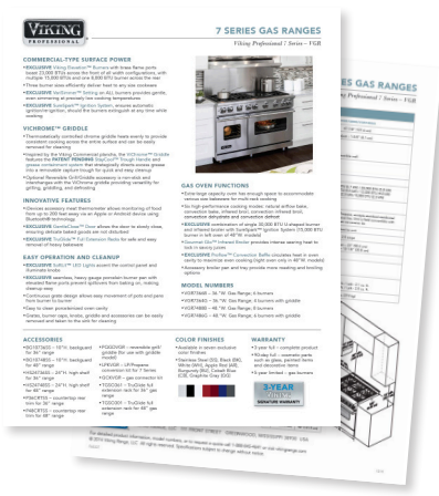
2-PAGE PRODUCT SPEC SHEETS Provides comprehensive features and specifications. VIKINGRANGE.COM PRODUCT PAGE