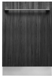
DFI663 Fully Integrated

ASKO products meet the highest demands in performance and durability, as well as environmental awareness. Every detail, right down to the component level, is tested to last for at least 20 years. They clean better, use less water, and last longer. All of the built-in dishwashers have earned the ENERGY STAR® label and some have earned ENERGY STAR® Most Efficient.