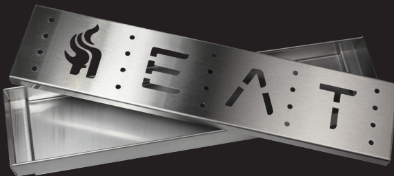
● Smoker Box