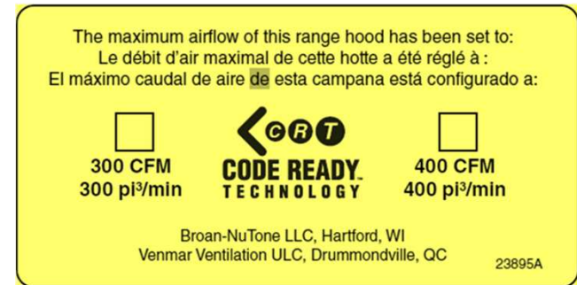
Additional Spec Label to Place on Blower