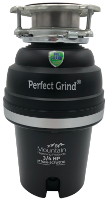
MT666-3CFWD3B 3/4 HP Garbage Disposer

The basics needed to complete your Kitchen Sink. Additional upgrades available below.