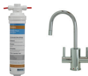
MT1250XL + Hot/Cold Francis Anthony Accessory Faucet (in CPB) Point-of-Use Filter