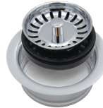
MT200EV/BRS Stopper/Strainer Disposer Trim