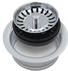
MT200EV/BRS Stopper/Strainer Disposer Trim