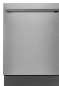
DFI663 Fully Integrated