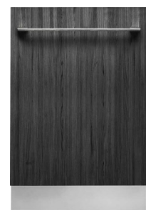
DBI663THS Tubular Handle