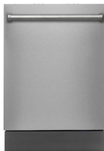
DBI663PHS Pro Handle