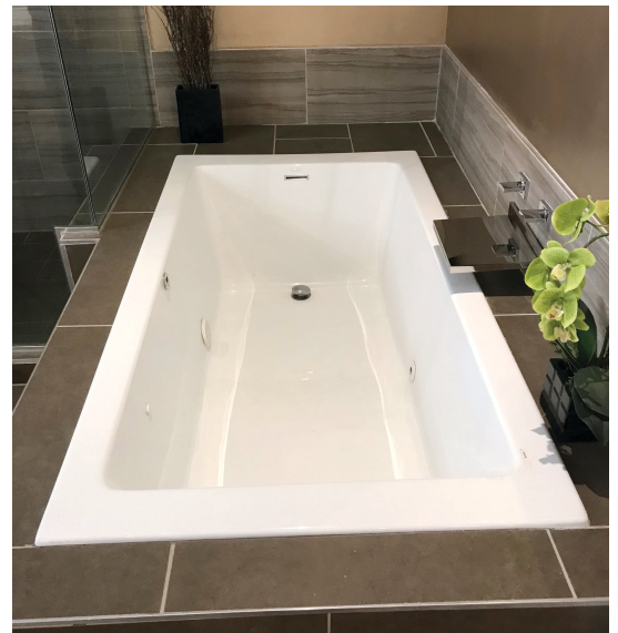
Lacey with Hydro Fusion.