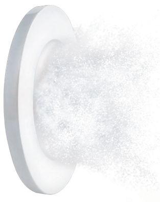
Typical bubble 2 mm