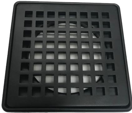
Grid Pattern Drain for Tile