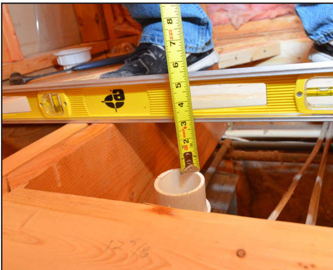
Prepare for a drain connection by cutting the drain pipe below the shower base's support structure: 27/8" for gray drain assemblies; 21/2" for white drain assemblies.