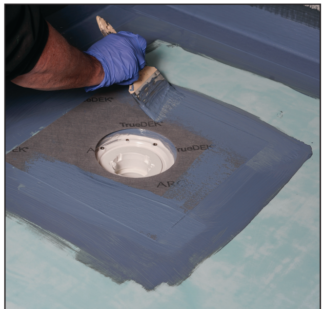
Embedding gasket over drain.