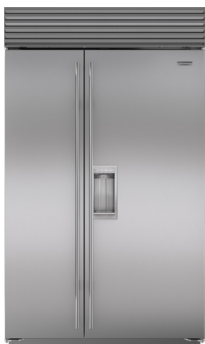
Any full size refrigeration.

PURCHASE A SUB-ZERO AND WOLF QUALIFYING APPLIANCE PACKAGE