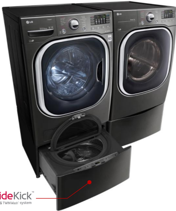
LG SideKick™ part of the LG TWINWash® system