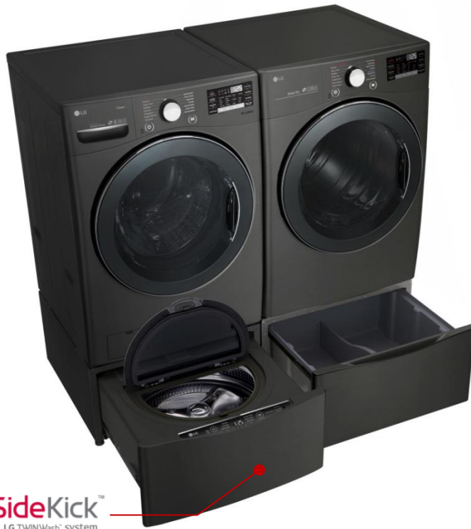
LG SideKick™ part of the LG TWINWash® system