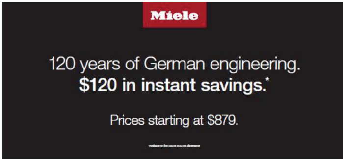
Tent Card - Top (A99D321)