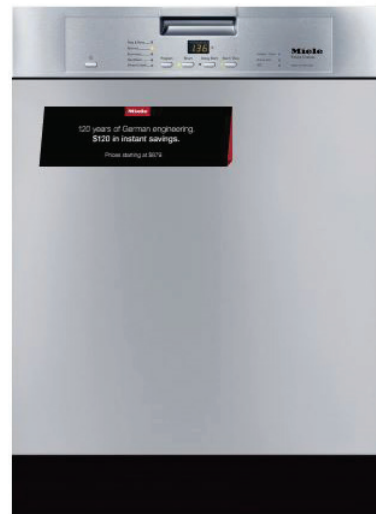
Tent Card - Front (A99D322)

Application: displayed on top of dishwasher (via low adhesive strip)