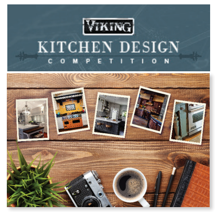
2018 VIKING DESIGNER OF THE YEAR One Grand Prize Winner will be featured in an ad in Architectural Digest . Quarterly winners receive global recognition and prizes. VIKINGRANGE.COM/DESIGNERS