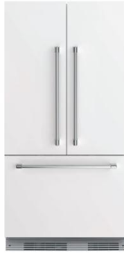
RS36A72JCI RS36AC (Optional Heritage Handle Accessory Kit)

72" INTEGRATED FRENCH DOOR 80"/84" INTEGRATED FRENCH DOOR *Shown with optional stainless steel panels