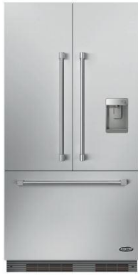
RS36A72UCI RS36A80UCI ICE & WATER