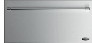
RB36 & DD36