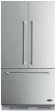
RS36A72JCI RS36A80JCI ICE ONLY