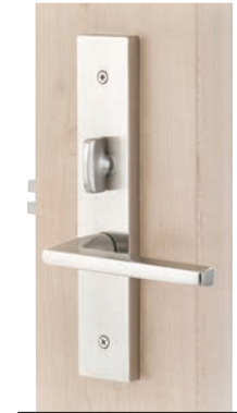
Interior trim view

To order: Function + Product Code + Backset + Knob/Lever Style + Handing + Finish + Add Door Thickness to Comments