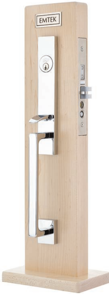
ANSI F13 Adelaide Mortise