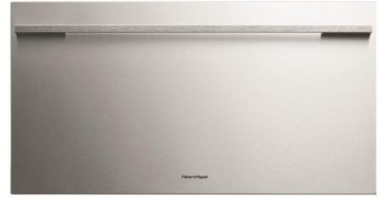
RB36S25MKIW RB90/36S SX Stainless Panel