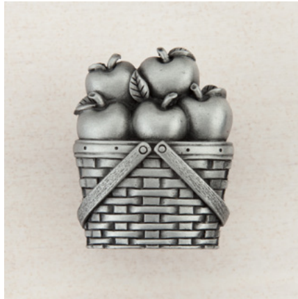
DQAPP - APPLE BASKET - 1-1/2" x 1-1/4"