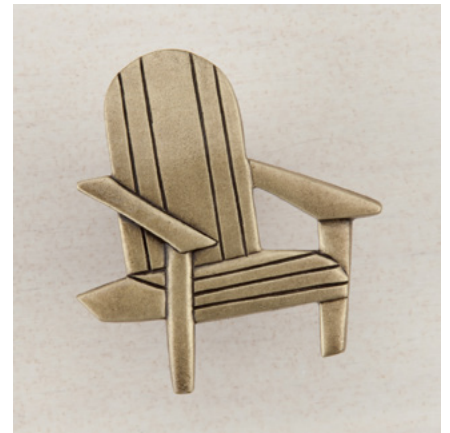
DPJAP - BEACH CHAIR - 1-3/4" x 1-1/2"