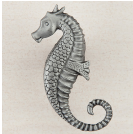
DPEPP - SEAHORSE - 2-1/4" x 1-1/8"