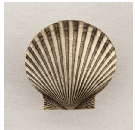
DPGAP - LARGE SCALLOP - 1-5/8" x 1-5/8"

For additional information, please call 508-339-4500