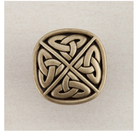
DQGAP - CELTIC SQUARE - 1-1/4" x 1-1/4"