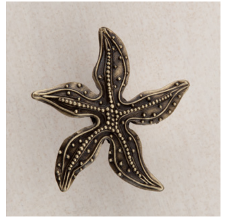
DPNAP - BEADED STARFISH - 1-7/8" x 1-5/8"