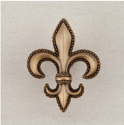
DQDGP - FLEUR-DE-LIS - 1-5/8" x 1-5/8"