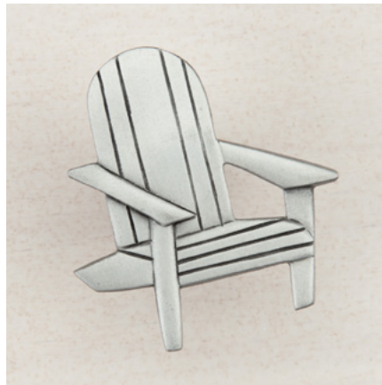
DPJPP - BEACH CHAIR - 1-3/4" x 1-1/2"