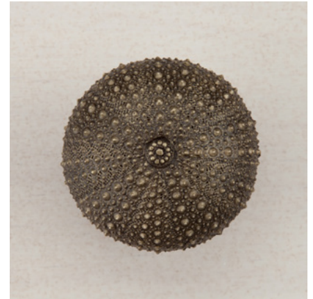
DP7AP - SEA URCHIN - 1-1/2" x 1-1/2"