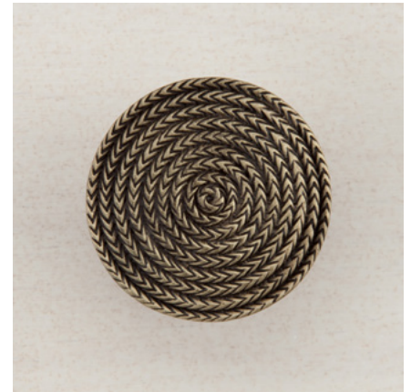
DQHAP - ROPE CIRCLE - 1-1/2" x 1-1/2"