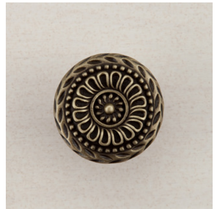
DQFAP - LACE CIRCLE - 1-1/4" x 1-1/4"

For additional information, please call 508-339-4500