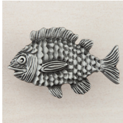
DPLPP - FUN FISH - 1-5/8" x 2-1/2"