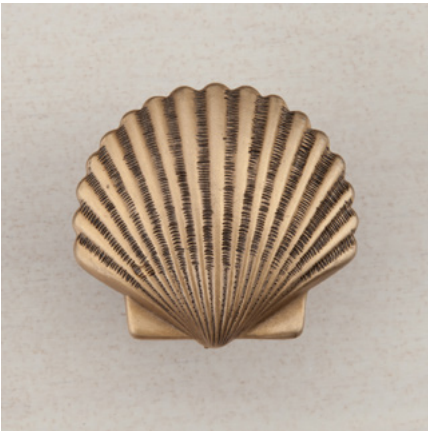
DPAGP - SMALL SCALLOP - 1-3/8" x 1-1/2"