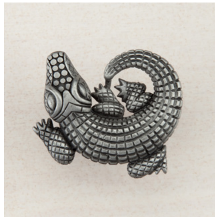
DMPMP - ALLIGATOR - 1-1/2" x 1-1/2"