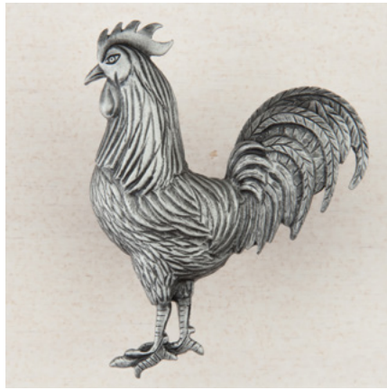
DQ9PP - ROOSTER - 2-1/8" x 1-5/8"