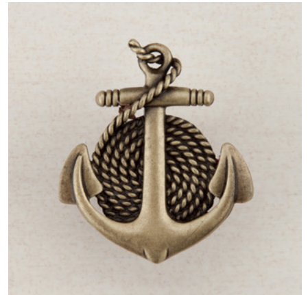
DP2AP - ANCHOR/ROPE - 1 3/4" x 1-1/2"