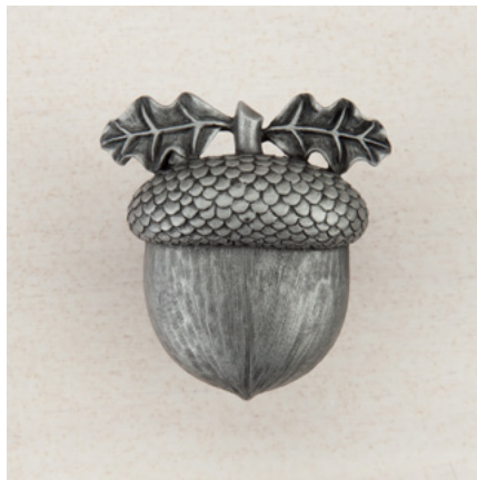
DQ3PP - ACORN - 1-3/8" x 1-3/8"