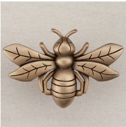
DQ7GP - BEE - 1-1/2" x 2-1/4"