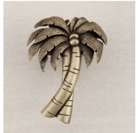
DQ1AP - PALM TREES - 1-7/8" x 1-1/2"