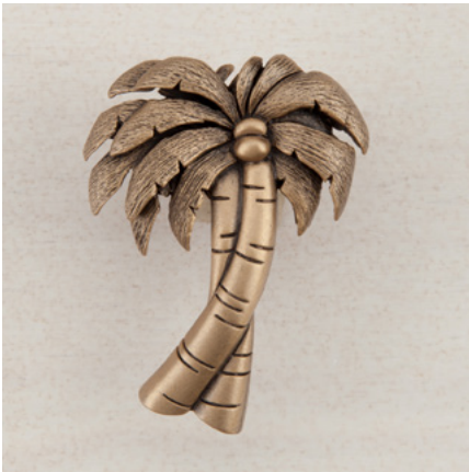
DQ1GP - PALM TREES - 1-7/8" x 1-1/2"