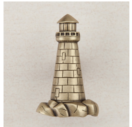
DP4AP - LIGHTHOUSE - 1-7/8" x 1-1/8"

For additional information, please call 508-339-4500