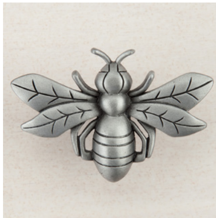
DQ7PP - BEE - 1-1/2" x 2-1/4"