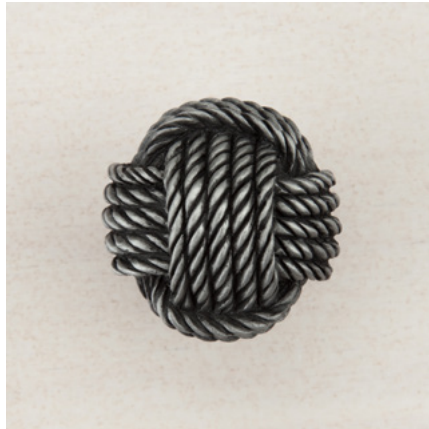
DPFPP - MONKEY'S FIST - 1-1/4" x 1-1/4"