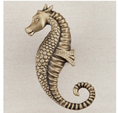
DPEAP - SEAHORSE - 2-1/4" x 1-1/8"