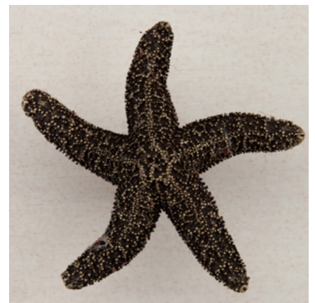
DPKAP - NATURAL STARFISH - 2-1/4" x 2-1/4"