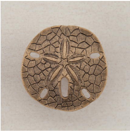
DPDGP - SANDDOLLAR - 1-1/2" x 1-1/2"