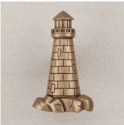
DP4GP - LIGHTHOUSE - 1-7/8" x 1-1/8"