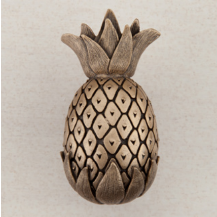
DQ2GP - PINEAPPLE - 2" x 1"