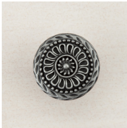
DQFPP - LACE CIRCLE - 1-1/4" x 1-1/4"