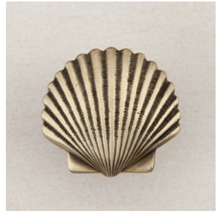
DPAAP - SMALL SCALLOP - 1-3/8" x 1-1/2"