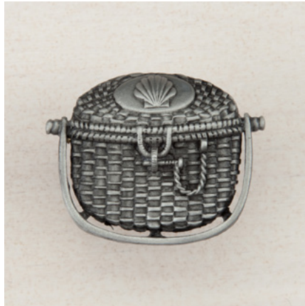
DPBPP - NANTUCKET BASKET - 1-3/8" x 1-5/8"