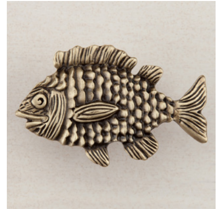
DPLAP - FUN FISH - 1-5/8" x 2-1/2"