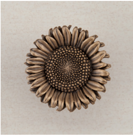
DQ8GP - SUNFLOWER - 1-3/8" x 1-3/8"