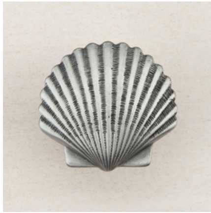
DPAPP - SMALL SCALLOP - 1-3/8" x 1-1/2"