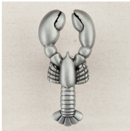
DP8PP - LOBSTER - 2" x 1"