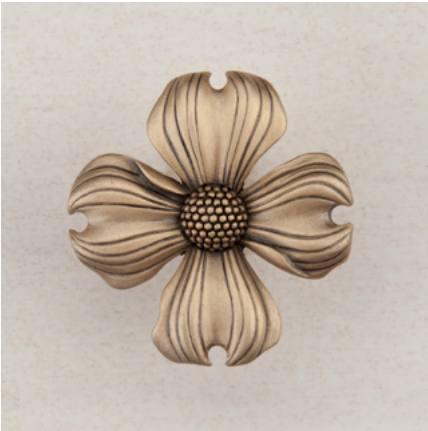
DQ6GP - DOGWOOD - 1-1/2" x 1-1/2"