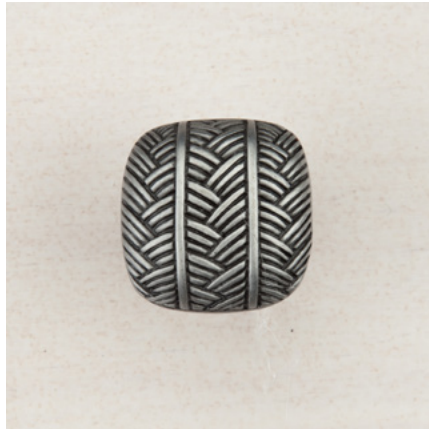
DQEPP - WOVEN SQUARE - 1" x 1"