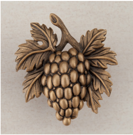
DQ5GP - GRAPEVINES - 2" x 1-3/4"