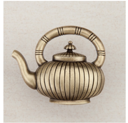
DQCAP - TEAPOT - 1-1/2" x 1-3/4"