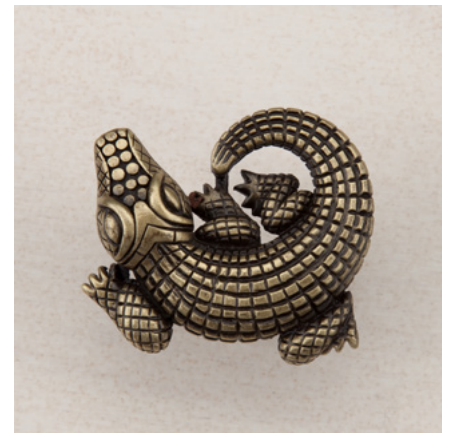
DMPAP - ALLIGATOR - 1-1/2" x 1-1/2"

For additional information, please call 508-339-4500