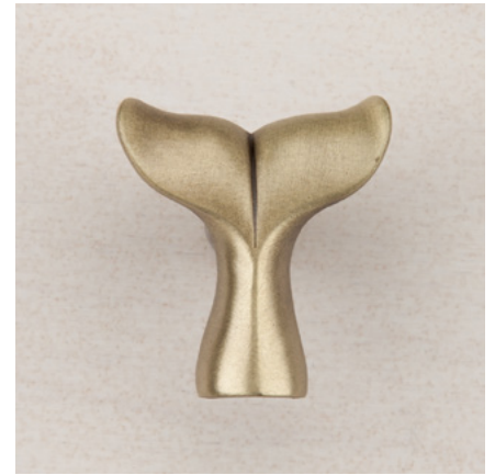
DP6AP - WHALE TAIL - 1-1/2" x 1-1/4"