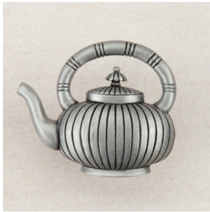
DQCPP - TEAPOT - 1-1/2" x 1-3/4"