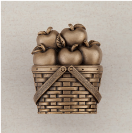
DQAGP - APPLE BASKET- 1-1/2" x 1-1/4"