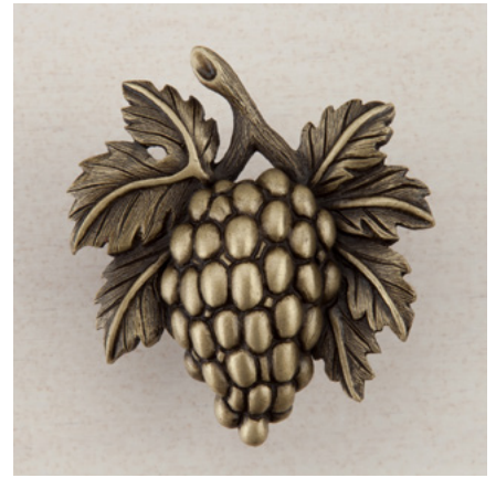
DQ5AP - GRAPEVINES - 2" x 1-3/4"