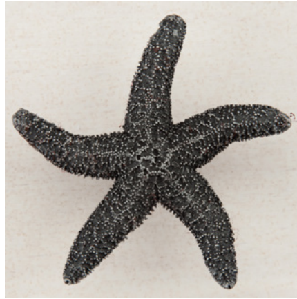
DPKPP - NATURAL STARFISH - 2-1/4" x 2-1/4"