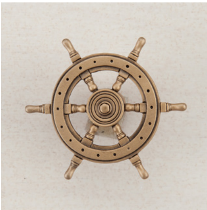
DPCGP - SHIP'S WHEEL - 1-3/4" x 1-3/4"