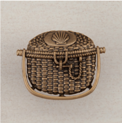
DPBGP - NANTUCKET BASKET - 1-3/8" x 1-5/8"