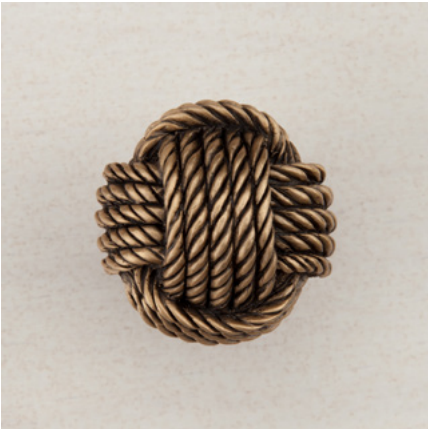
DPFGP - MONKEY'S FIST - 1-1/4" x 1-1/4"