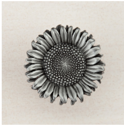
DQ8PP - SUNFLOWER - 1-3/8" x 1-3/8"