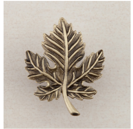
DQ4AP - LEAF - 1-3/4" x 1-3/8"