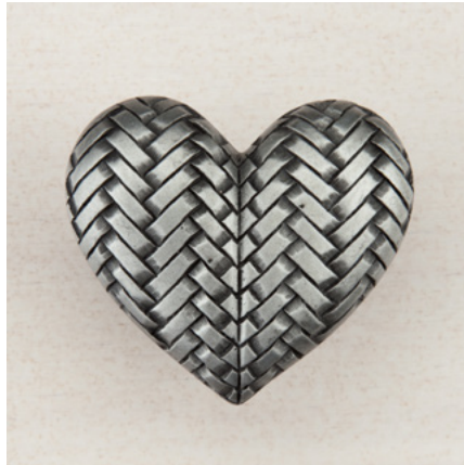
DQJPP - WOVEN HEART - 1-1/2" x 1-3/4"