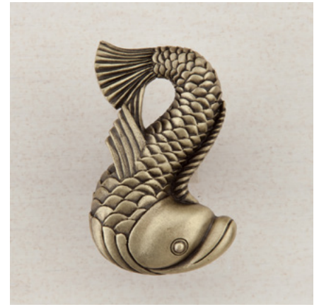
DP5AP - DOLPHIN - 1-3/4" x 1-1/8"