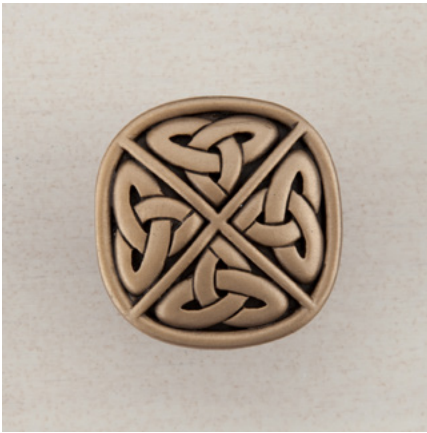
DQGPP - CELTIC SQUARE - 1-1/4" x 1-1/4"