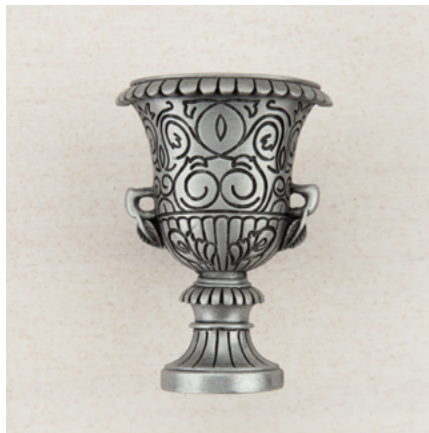
DQBPP - URN - 1-5/8" x 1-1/8"