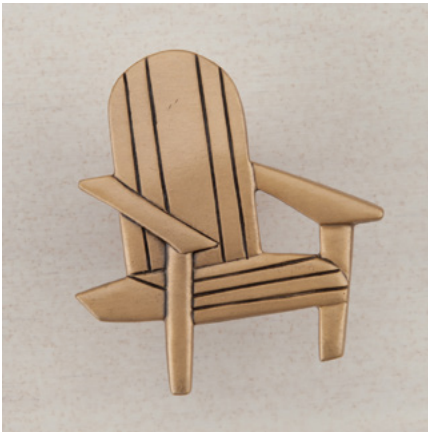
DPJGP - BEACH CHAIR - 1-3/4" x 1-1/2"