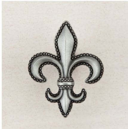
DQDPP - FLEUR-DE-LIS - 1-5/8" x 1-5/8"