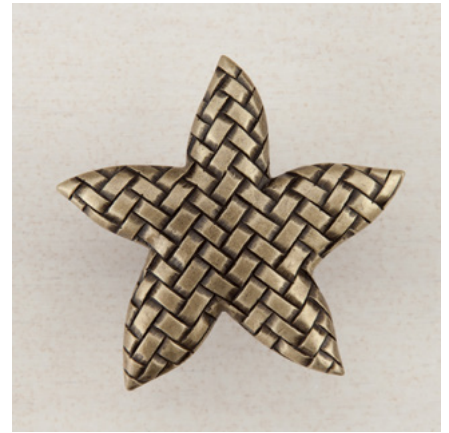
DP9AP - WOVEN STAR - 1-3/4" x 1-5/8"