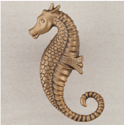
DPEGP - SEAHORSE - 2-1/4" x 1-1/8"