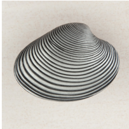
DP3PP - CLAM SHELL - 1-3/8" x 1-7/8"