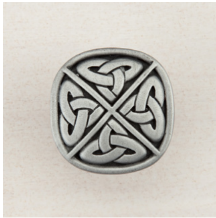
DQGPP - CELTIC SQUARE - 1-1/4" x 1-1/4"