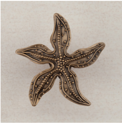
DPNGP - BEADED STARFISH - 1-7/8" x 1 5/8"