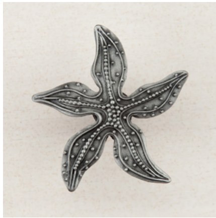
DPNPP - BEADED STARFISH - 1-7/8" x 1-5/8"