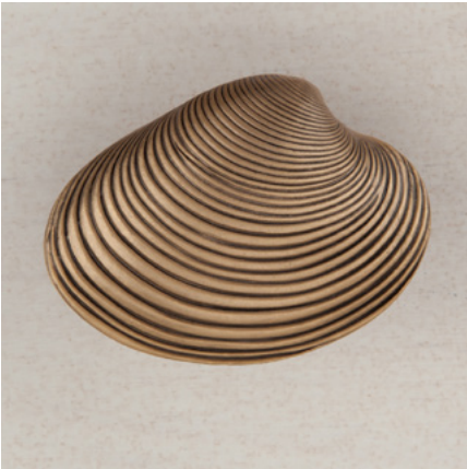
DP3GP - CLAM SHELL - 1-3/8" x 1-7/8"