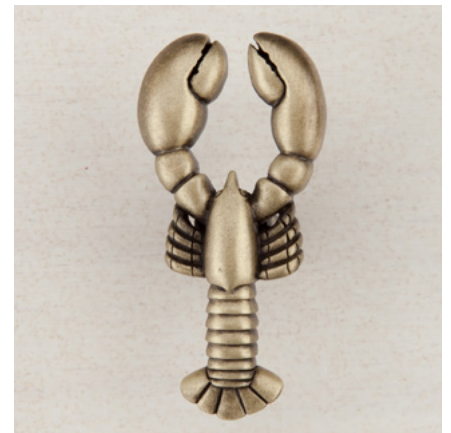
DP8AP - LOBSTER - 2" x 1"

For additional information, please call 508-339-4500