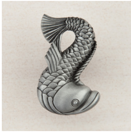
DP5PP - DOLPHIN - 1-3/4" x 1-1/8"