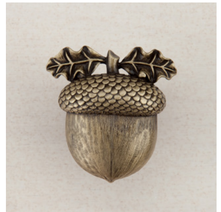
DQ3AP - ACORN - 1-3/8" x 1-3/8"

For additional information, please call 508-339-4500