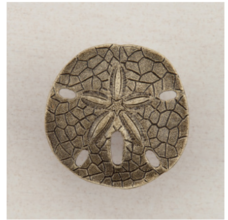
DPDAP - SANDDOLLAR - 1-1/2" x 1-1/2"