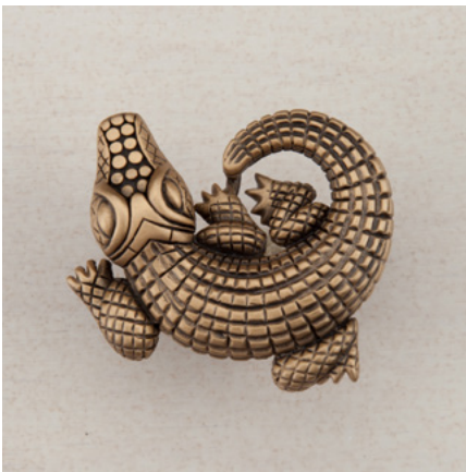
DPMGP - ALLIGATOR - 1-1/2" x 1-1/2"