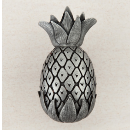
DQ2PP - PINEAPPLE - 2" x 1"