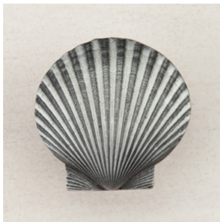
DPGPP - LARGE SCALLOP - 1-5/8" x 1-5/8"