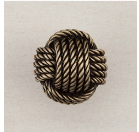
DPFAP - MONKEY'S FIST - 1-1/4" x 1-1/4"