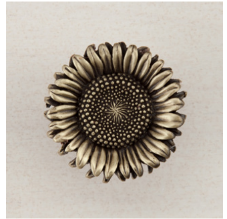
DQ8AP - SUNFLOWER - 1-3/8" x 1-3/8"