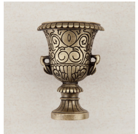
DQBAP - URN - 1-5/8" x 1-1/8"

For additional information, please call 508-339-4500