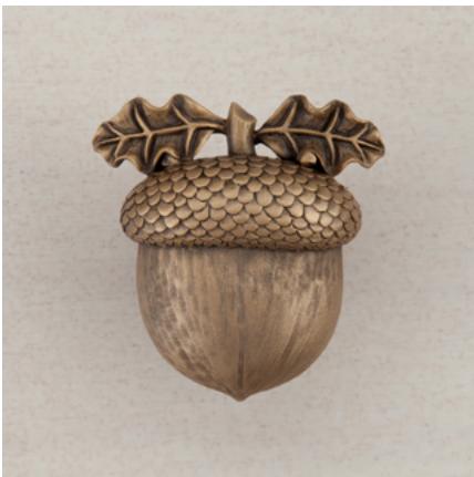
DQ3GP - ACORN - 1-3/8" x 1-3/8"