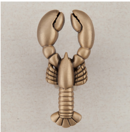
DP8GP - LOBSTER - 2" x 1"