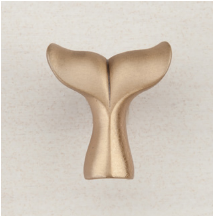
DP6GP - WHALE TAIL - 1-1/2" x 1-1/4"