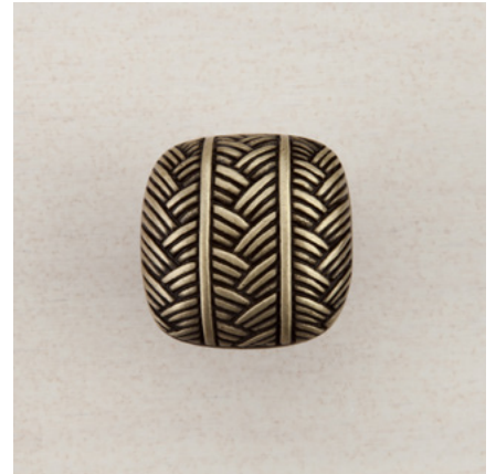
DQEAP - WOVEN SQUARE - 1" x 1"