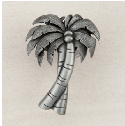
DQ1PP - PALM TREES - 1-7/8" x 1-1/2"