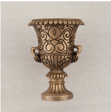
DQGBP - URN - 1-5/8" x 1-1/8"