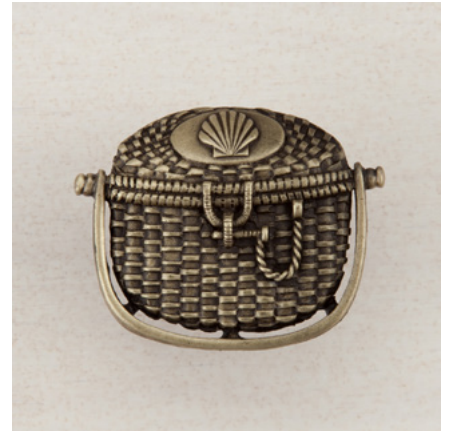
NANTUCKET BASKET - 1-3/8" x 1-5/8"