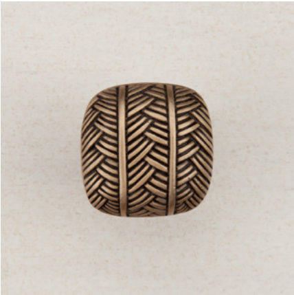
DQEGP - WOVEN SQUARE - 1" x 1"