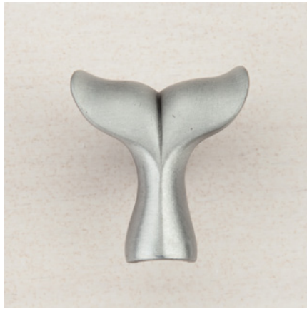
DP6PP - WHALE TAIL - 1-1/2" x 1-1/4"