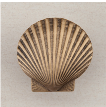
DPGGP - LARGE SCALLOP - 1-5/8" x 1-5/8"