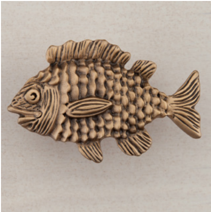
DPLGP - FUN FISH - 1-5/8" x 2-1/2"