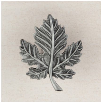
DQ4PP - LEAF - 1-3/4" x 1-3/8"