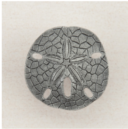
DPDPP - SANDDOLLAR - 1-1/2" x 1-1/2"