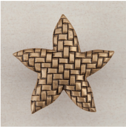
DP9GP - WOVEN STAR - 1-3/4" x 1-5/8"