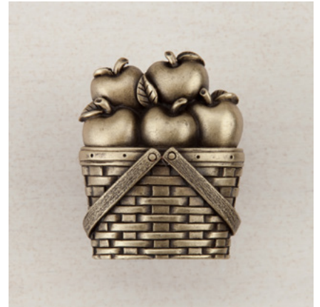
DQAAP - APPLE BASKET - 1-1/2" x 1-1/4"