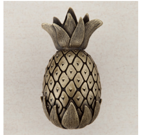
DQ2AP - PINEAPPLE - 2" x 1"