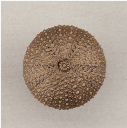
DP7GP - SEA URCHIN - 1-1/2" x 1-1/2"