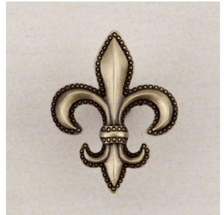
DQDAP - FLEUR-DE-LIS - 1-5/8" x 1-5/8"