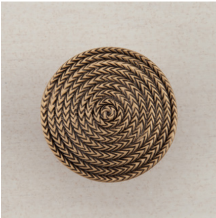
DQHGP - ROPE CIRCLE - 1-1/2" x 1-1/2"