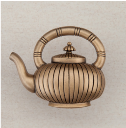
DQCGP - TEAPOT - 1-1/2" x 1-3/4"