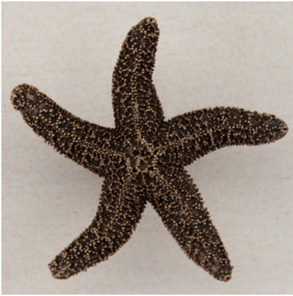
DPKGP - NATURAL STARFISH - 2-1/4" x 2-1/4"