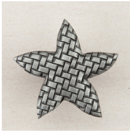
DP9PP - WOVEN STAR - 1-3/4" x 1-5/8"