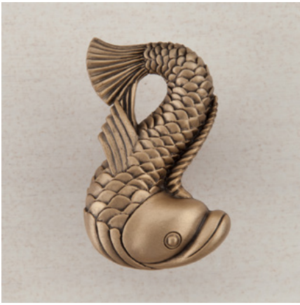
DP5GP - DOLPHIN - 1-3/4" x 1-1/8"