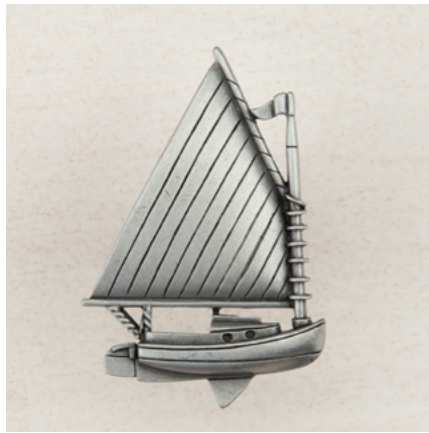
DP1PP - CATBOAT - 2" x 1-1/4"