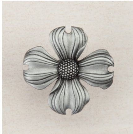
DQ6PP - DOGWOOD - 1-1/2" x 1-1/2"