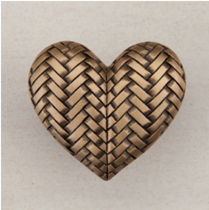
DQJGP - WOVEN HEART - 1-1/2" x 1-3/4"