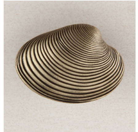
DP3AP - CLAM SHELL - 1 3/8" x 1-7/8"