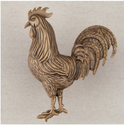
DQ9GP - ROOSTER - 2-1/8" x 1-5/8"