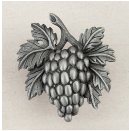
DQ5PP - GRAPEVINES - 2" x 1-3/4"