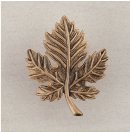
DQ4GP - LEAF - 1-3/4" x 1-3/8"