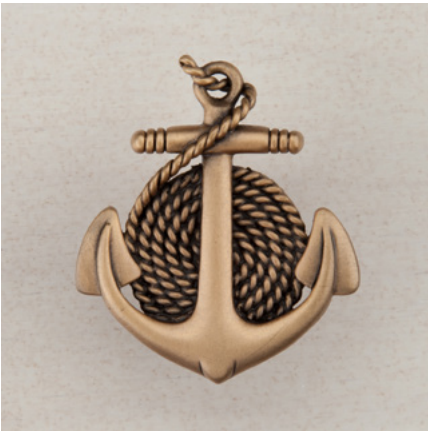
DP2GP - ANCHOR/ROPE - 1 3/4" x 1-1/2"