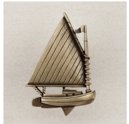
DP1AP - CATBOAT - 2" x 1-1/4"