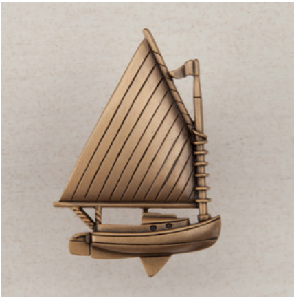
DP1GP - CATBOAT - 2" x 1-1/4"