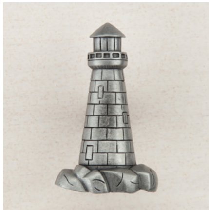
DP4PP - LIGHTHOUSE - 1-7/8" x 1-1/8"