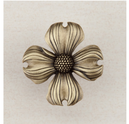
DQ6AP - DOGWOOD - 1-1/2" x 1-1/2"