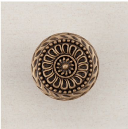
DQFGP - LACE CIRCLE - 1-1/4" x 1-1/4"