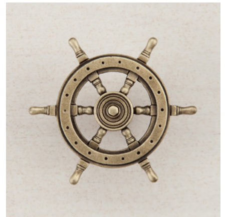
DPCAP - SHIP'S WHEEL - 1-3/4" x 1-3/4"

For additional information, please call 508-339-4500