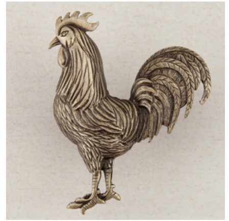
DQ9AP - ROOSTER - 2-1/8" x 1-5/8"