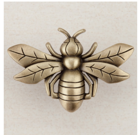
DQ7AP - BEE - 1-1/2" x 2-1/4"

For additional information, please call 508-339-4500