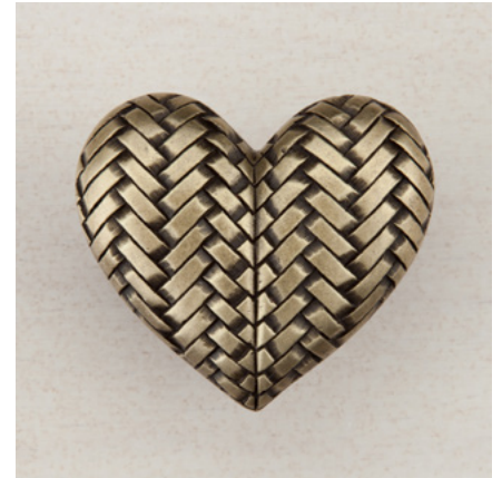
DQJAP - WOVEN HEART - 1-1/2" x 1-3/4"