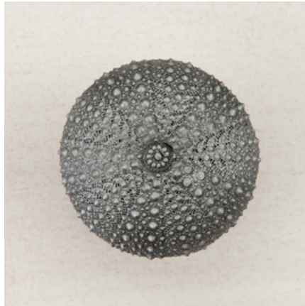
DP7PP - SEA URCHIN - 1-1/2" x 1-1/2"