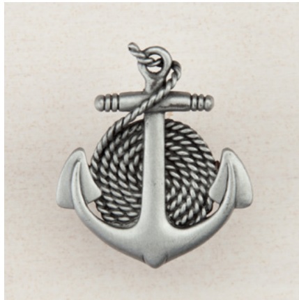
DP2PP - ANCHOR/ROPE - 1 3/4" x 1-1/2"