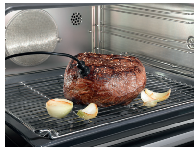
Wired roast probe for perfect roasting results