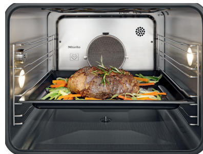
XXL stainless steel cavity