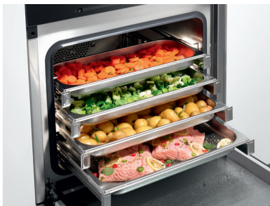
Cooking on 4 shelf levels