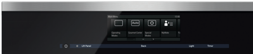
M Touch controls for easy navigation with the swipe of the screen