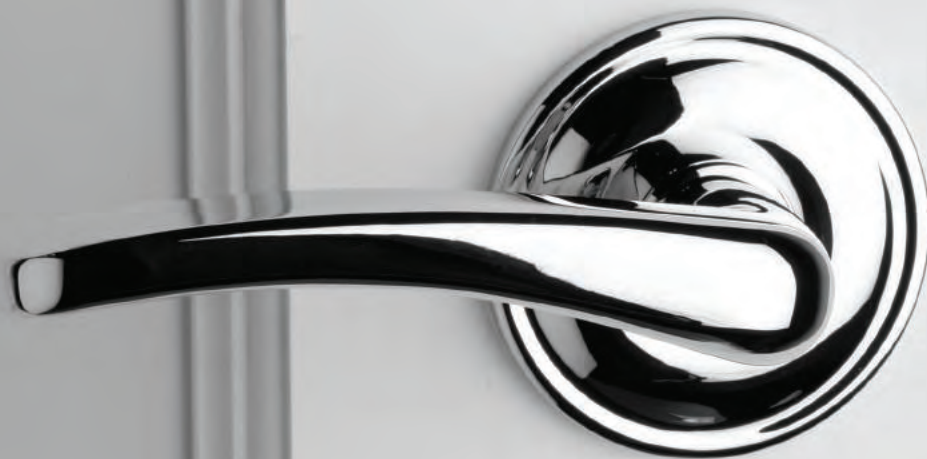
Moderne 945-0 Handed Shown in US26