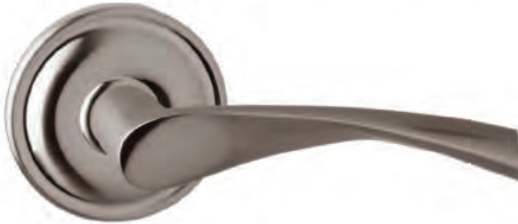
935-0 Handed (US10B, US15, US26) Function Passage/Privacy $102 Half Dummy $51

Moderne -0 Rosette Size is 2 5/8" diameter