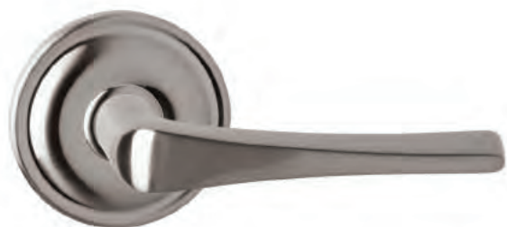
942-0 Non-Handed (US10B, US15, US26) Function Passage/Privacy $102 Half Dummy $51