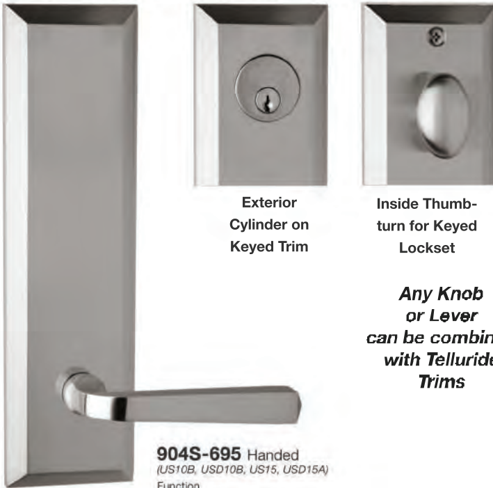
Exterior Cylinder on Keyed Trim

Telluride 695 & 696 Escutcheon Size is 9 5/16" X 2 5/8"