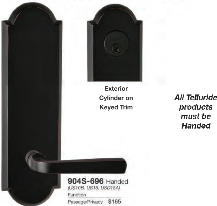
Exterior Cylinder on Keyed Trim

Telluride 696 Escutcheon Size is 10 1/2" X 3 1/8"