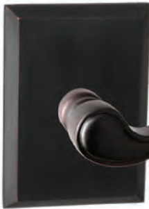
903-1 Handed (US10B, US15, US26) Function Passage/Privacy $118 Half Dummy $59

Rustico -1 & -2 Rosette Size is 3 5/8" x 2 5/8"