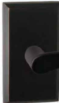
935G-1 Handed (US10B, US15) Function Passage/Privacy $154 Half Dummy $77