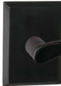
937-1 Handed (US10B, US15, US26) Function Passage/Privacy $118 Half Dummy $59