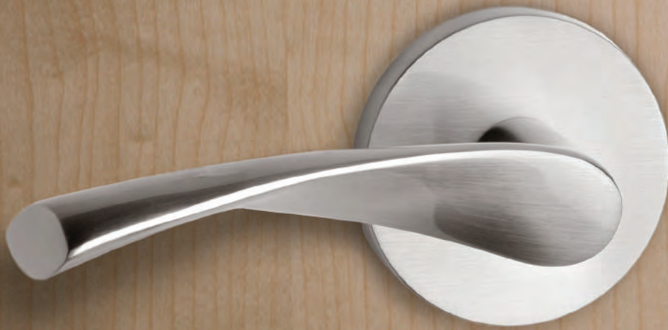
Haute Moderne 935-6 Handed Shown in US15