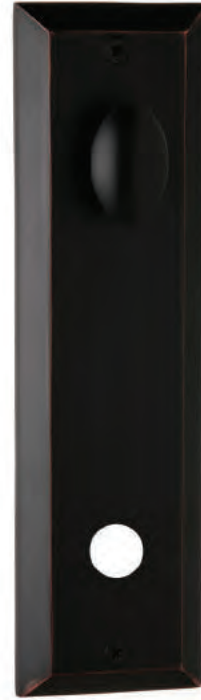
-615 Handed (PVD, US10B, USD10B, US15, USD15A, US26) Inside Trim - Prefix with any Lever or Knob selection

Pick any Lever or Knob to prefix any Interior Trims (for example 904S-616)