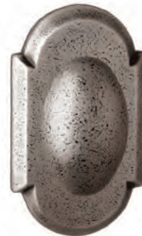
905G-2 Non-Handed (US10B, US15, USD15A) Function Passage/Privacy $154 Half Dummy $77