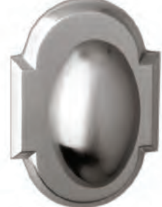
905-2 Non-Handed (US10B, US15) Function Passage/Privacy $118 Half Dummy $59