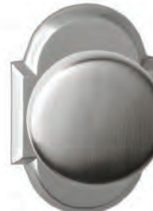
936-2 Non-Handed (US10B, US15) Function Passage/Privacy $118 Half Dummy $59