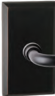
931G-1 Non-Handed (US10B, US15) Function Passage/Privacy $154 Half Dummy $77