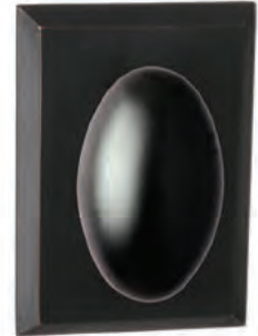
905-1 Non-Handed (PVD, US10B, US15, US26) Function Passage/Privacy $118 Half Dummy $59