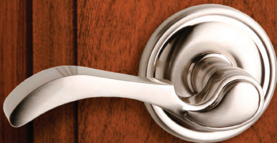
Traditional 903-0 Handed Shown in US15