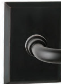
931-1 Non-Handed (US10B, US15, US26) Function Passage/Privacy $118 Half Dummy $59