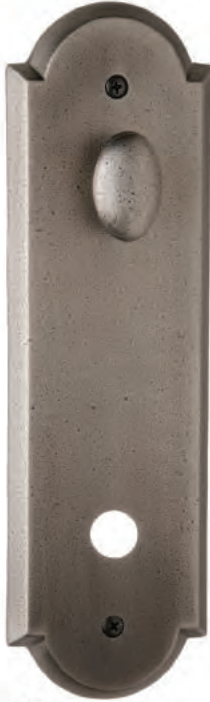
-616 Handed (US10B, US15, USD15A) Inside Trim - Prefix with any Lever or Knob selection

Pick any Lever or Knob to prefix any Interior Trims (for example 904S-616)