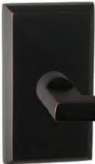
939G-1 Non-Handed (US10B, US15, USD10B, USD15A) Function Passage/Privacy $154 Half Dummy $77