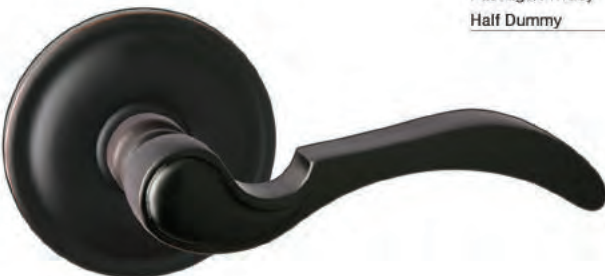
903-0 Handed (US10B, US15, US26) Function Passage/Privacy $102 Half Dummy $51