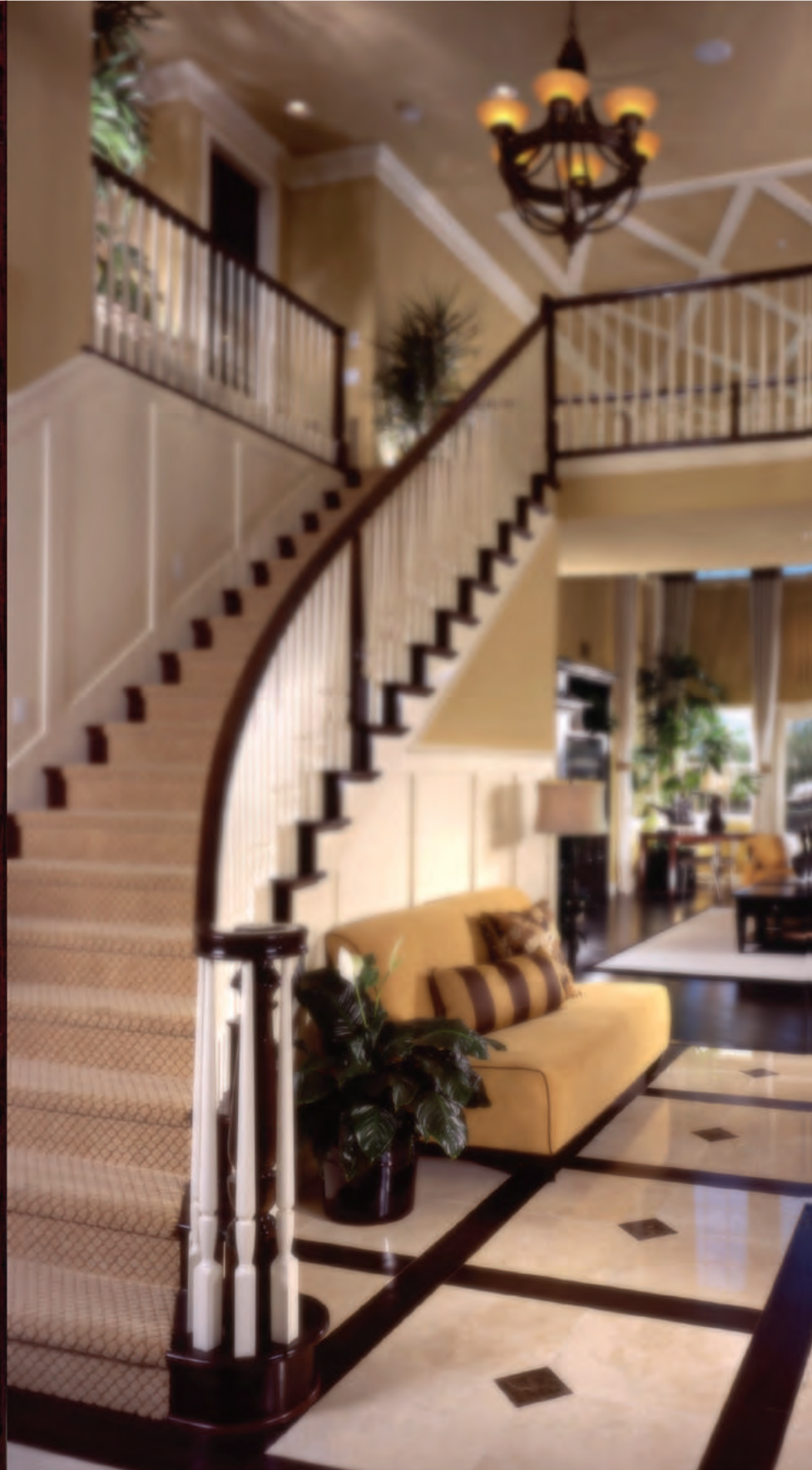
Handleset 980G-1 Non-Handed Shown in USD10B