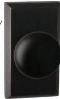
906G-1 Non-Handed (US10B, USD10B, US15, USD15A) Function Passage/Privacy $154 Half Dummy $77