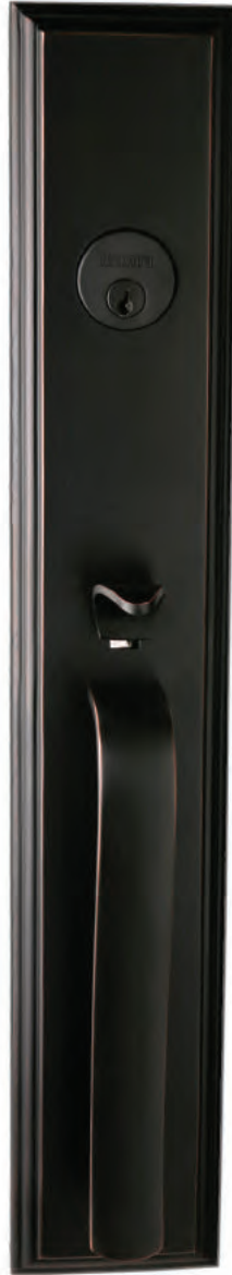
990 Non-Handed (US10B, US15, USD15A, US26) Function Full Dummy $310 Single Keyed $310