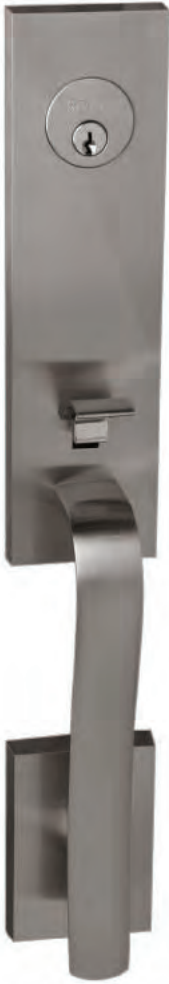
972 Non-Handed (US10B, US15, US26) Function Full Dummy $310 Single Keyed $310