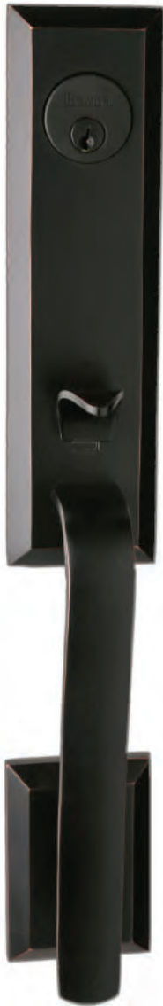
971 Non-Handed (US10B, US15, US26)