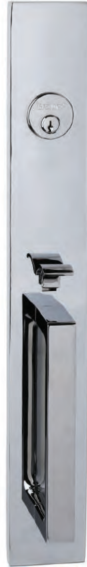
973 Non-Handed (US10B, US15, US26) Function Full Dummy $310 Single Keyed $310

Handlesets can be selected with Sectional or Full Interior Trims with no Price Difference