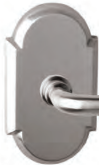
931G-2 Non-Handed (US10B, US15) Function Passage/Privacy $154 Half Dummy $77