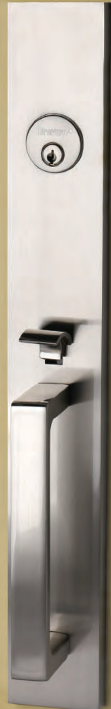
Handleset 973 Shown in US15