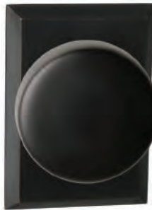
936-1 Non-Handed (US10B, US15) Function Passage/Privacy $118 Half Dummy $59