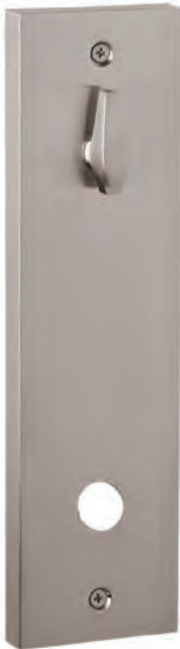
-672 Handed (US10B, US15, US26) Interior Trim - Prefix with any Lever or Knob selection

Handlesets can be selected with Sectional Interior Trims with no Price Difference