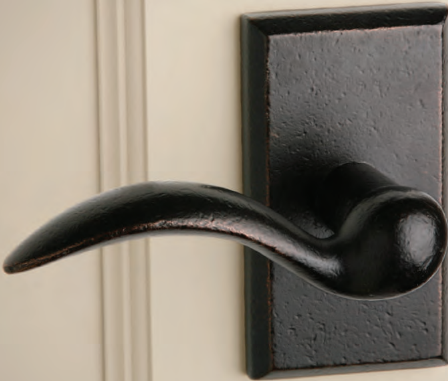
Rustico Grande 909G-1 Handed Shown in USD10B