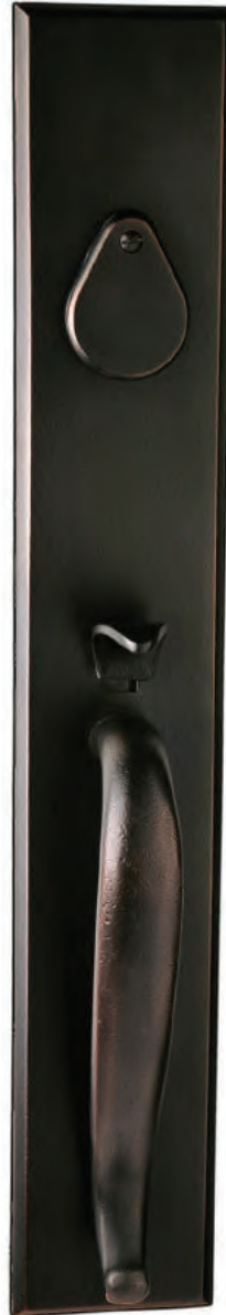
980G-1 Non-Handed (US10B, USD10B, US15, USD15A)