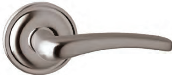
945-0 Handed (US10B, US15, US26) Function Passage/Privacy $102 Half Dummy $51