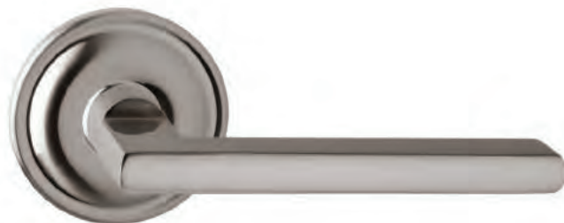
939-0 Non-Handed (US10B, US15, US26) Function Passage/Privacy $102 Half Dummy $51