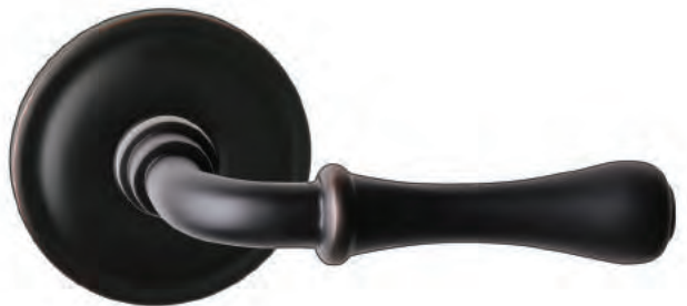
931-0 Non-Handed (US10B, US15, US26) Function Passage/Privacy $102 Half Dummy $51