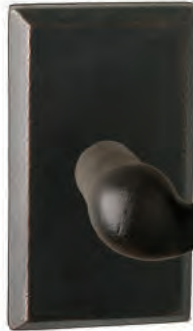
909G-1 Handed (US10B, USD10B, US15, USD15A) Function Passage/Privacy $154 Half Dummy $77