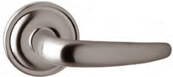
944-0 Non-Handed (US10B, US15, US26) Function Passage/Privacy $102 Half Dummy $51