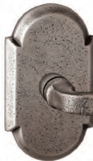
904SG-2 Non-Handed (US10B, US15, USD15A) Function Passage/Privacy $154 Half Dummy $77