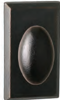
905G-1 Non-Handed (US10B, USD10B, US15, USD15A) Function Passage/Privacy $154 Half Dummy $77