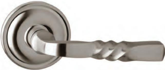
904-0 Non-Handed (PVD, US10B, US15, US26) Function Passage/Privacy $102 Half Dummy $51