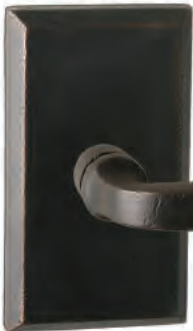
904SG-1 Non-Handed (US10B, USD10B, US15, USD15A) Function Passage/Privacy $154 Half Dummy $77

Rustico Grande G-1 & G-2 Rosette Size is 4 1/2" x 2 1/2"