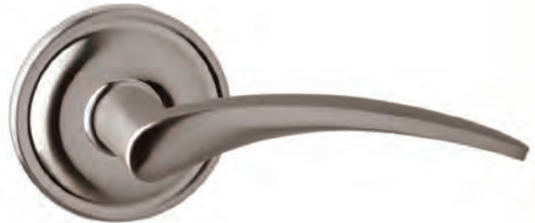
937-0 Handed (US10B, US15, US26) Function Passage/Privacy $102 Half Dummy $51