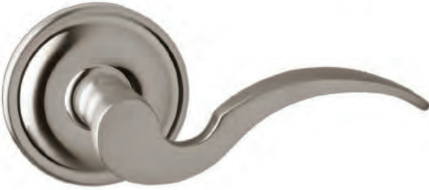
900-0 Handed (PVD, US10B, US15, US26) Function Passage/Privacy $102 Half Dummy $51

Traditional -0 Rosette Size is 2 5/8" diameter