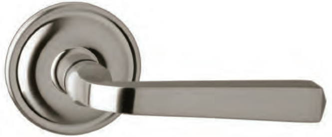
904S-0 Non-Handed (US10B, US15, US26) Function Passage/Privacy $102 Half Dummy $51