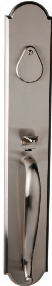
980G-2 Non-Handed (US10B, US15, USD15A)