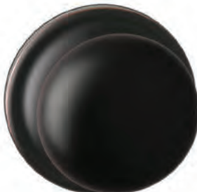
906-0 Non-Handed (PVD, US10B, US15, US26) Function Passage/Privacy $102 Half Dummy $51