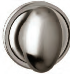
905-0 Non-Handed (PVD, US10B, US15, US26) Function Passage/Privacy $102 Half Dummy $51