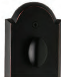
Inside Thumb- turn for Keyed Lockset