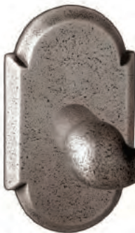
909G-2 Handed (US10B, US15, USD15A) Function Passage/Privacy $154 Half Dummy $77