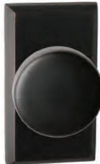
936G-1 Non-Handed (US10B, USD10B, US15, USD15A) Function Passage/Privacy $154 Half Dummy $77