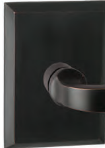
904S-1 Non-Handed (US10B, US15, US26) Function Passage/Privacy $118 Half Dummy $59