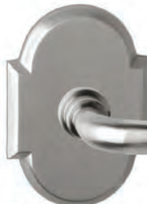
931-2 Non-Handed (US10B, US15) Function Passage/Privacy $118 Half Dummy $59