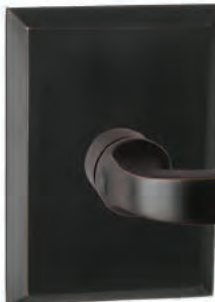
904-1 Non-Handed (PVD, US10B, US15, US26) Function Passage/Privacy $118 Half Dummy $59