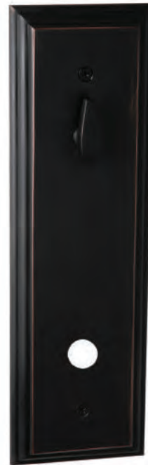
-690 Handed (PVD, US10B, US15, USD15A, US26) Interior Trim - Prefix with any Lever or Knob selection

Handlesets can be selected with Sectional Interior Trims with no Price Difference