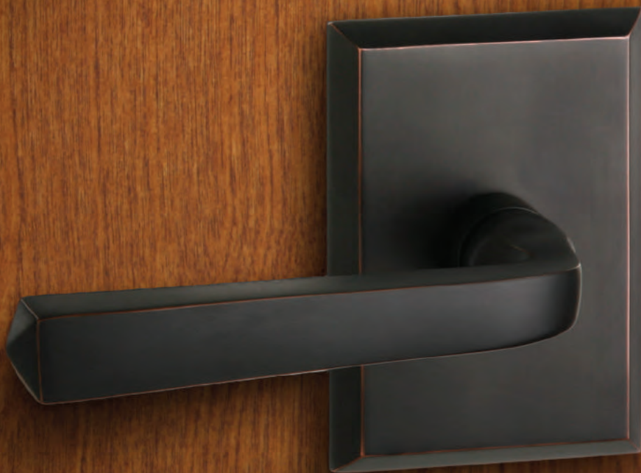
Rustico 904S-1 Non-Handed Shown in US10B