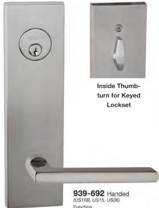
Inside Thumb- turn for Keyed Lockset