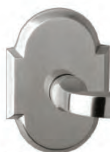
904S-2 Non-Handed (US10B, US15) Function Passage/Privacy $118 Half Dummy $59