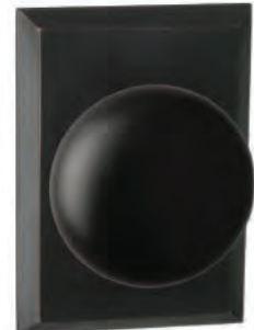
906-1 Non-Handed (PVD, US10B, US15, US26) Function Passage/Privacy $118 Half Dummy $59