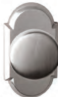
936G-2 Non-Handed (US10B, US15, USD15A) Function Passage/Privacy $154 Half Dummy $77