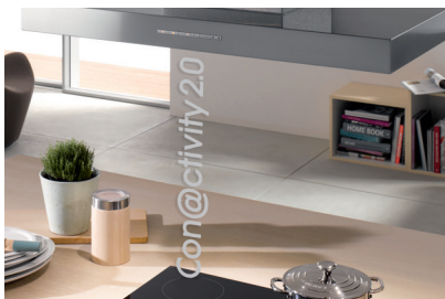
Con@ctivity 2.0 — communication between cooktop and hood