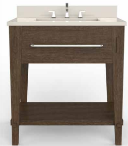
Portland in Vintage Café (R12)