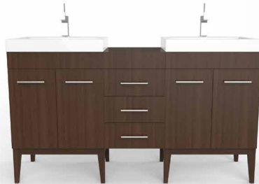
Venus in American Walnut (E56)