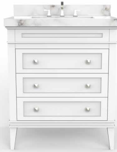
Laurel in White (W01)