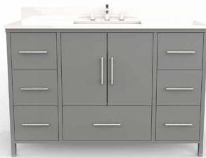
Juno in Slate Gray (E12)