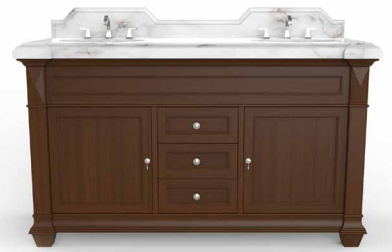
Torino in Café Walnut (F13)