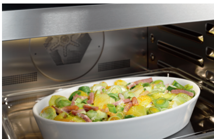
Combination of convection heat and microwave makes cooking much quicker