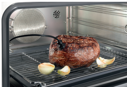
Wired roast probe for the perfect roasting results