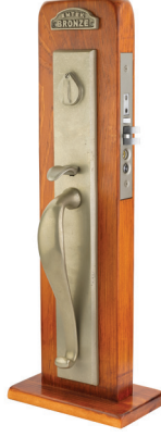
Rectangular Full Length Mortise