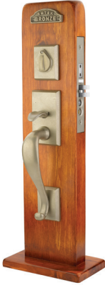
Rectangular Sectional Mortise