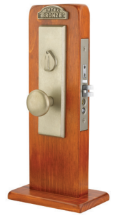
Rectangular Mortise Knob by Knob

Order any Sandcast Bronze Knob or Lever for the Inside Trim.