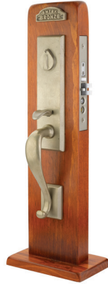
Rectangular Monolithic Mortise