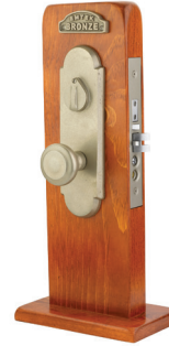
Cheyenne Mortise Knob by Knob

Order any Sandcast Bronze Knob or Lever for the Inside Trim.