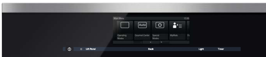
M Touch controls for easy navigation with the swipe of the screen