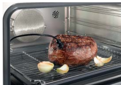
Wired roast probe for perfect roasting results