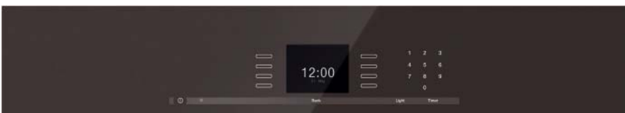
SensorTronic controls clearly present menu content