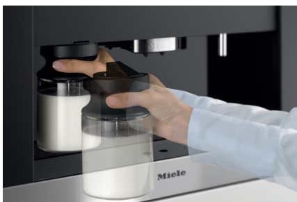
EasyClick Milk System