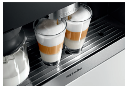
OneTouch for Two