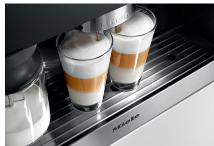
OneTouch for Two