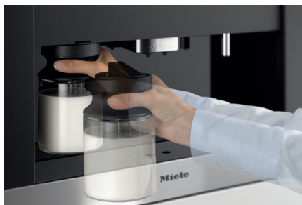
EasyClick Milk System