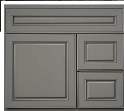
Bottom Right: Interlude/Hickory/Shale

In addition to these colors, don't forget our High Gloss Steel 3D laminate, or our several grey Oasis options (Heather, Asphalt, Breccia, Galena, Platinum, Cement, Concrete, to name a few).