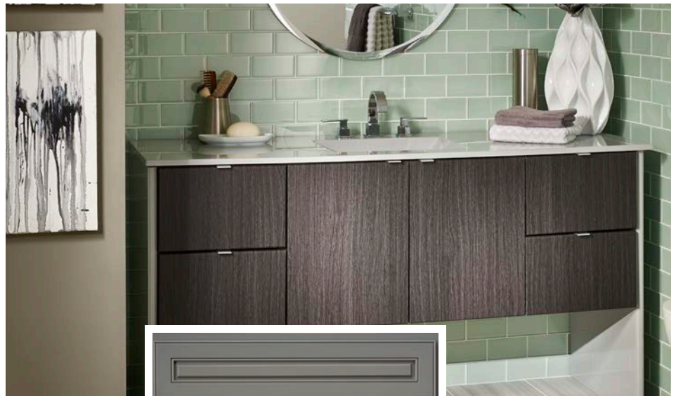
Top picture: Insignia/ Queensland Oak

With the surge in grey everywhere in the home furnishings arena, Bertch has seen steady sales with those colors. We do believe, however, there is room for growth. Is grey popular in your market? Do you have it in your showroom? Use some of those flex funds on new samples and displays!