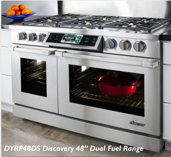
DYRP48DS Discovery 48" Dual Fuel Range

JUST IN TIME FOR THE HOLIDAYS. Our new Discovery iQ Dual-Fuel Range. Why are we so excited? Because this award-winning range is a game changer. It's the world's first Range featuring an Android Controller. What does that mean to your Customers?