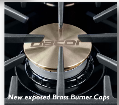
New exposed Brass Burner Caps

"I'm a time-challenged perfectionist so I think a range texting me when it's done cooking my family meal is pure genius. I'm also design-sensitive so I'm equally enthralled that this range is so sharp looking. I wish it had wheels so that I could cruise to the grocery store in it." - Vern Yip —Washington Post