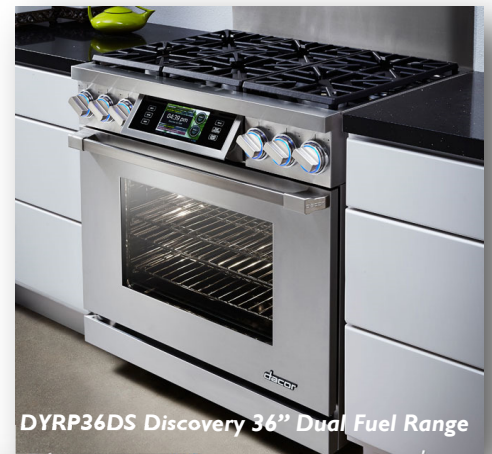
DYRP36DS Discovery 36" Dual Fuel Range