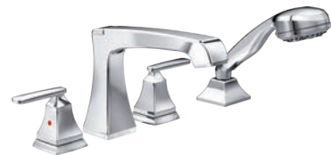
4-Hole Roman Tub T4764 R4707 (not shown)