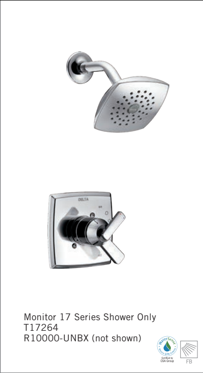
Monitor 17 Series Shower Only T17264 R10000-UNBX (not shown)