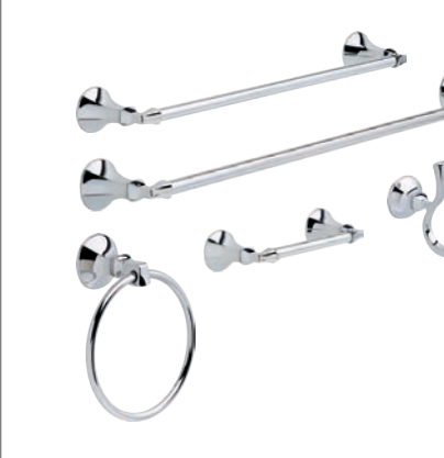
76418 18" Towel Bar 76424 24" Towel Bar 76435 Double Robe Hook 76446 Towel Ring 46450 Tissue Holder

TouchClean® soft rubber spray holes allow you to easily wipe away calcium and lime build-up from the spray face with the touch of a finger.