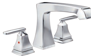
3-Hole Roman Tub T2764 R2707 (not shown)