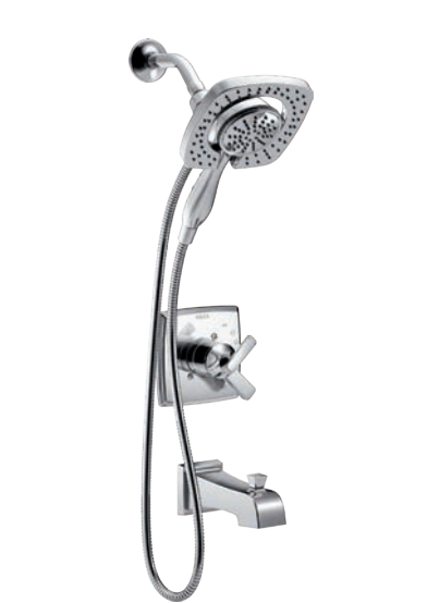
Monitor 17 Series Shower with In2ition® T17464-I R10000-UNBX