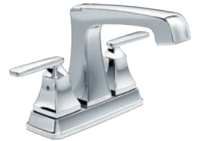
Two Handle Centerset Lav Faucet - Tract Pack 2564-TP-DST