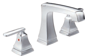
Two Handle Widespread 3564-MPU-DST

EZ Anchor® — Simplifies installation by allowing the faucet to be secured from above the sink without having to go under the sink to tighten it.