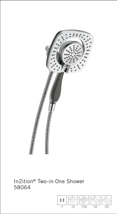
In2ition® Two-in-One Shower 58064