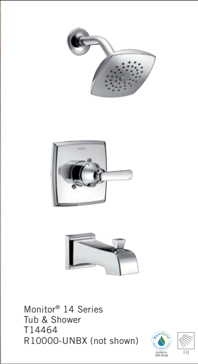
Monitor® 14 Series Tub & Shower T14464 R10000-UNBX (not shown)