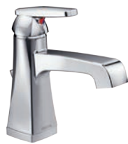
Single-Hole 564-MPU-DST Optional escutcheon included