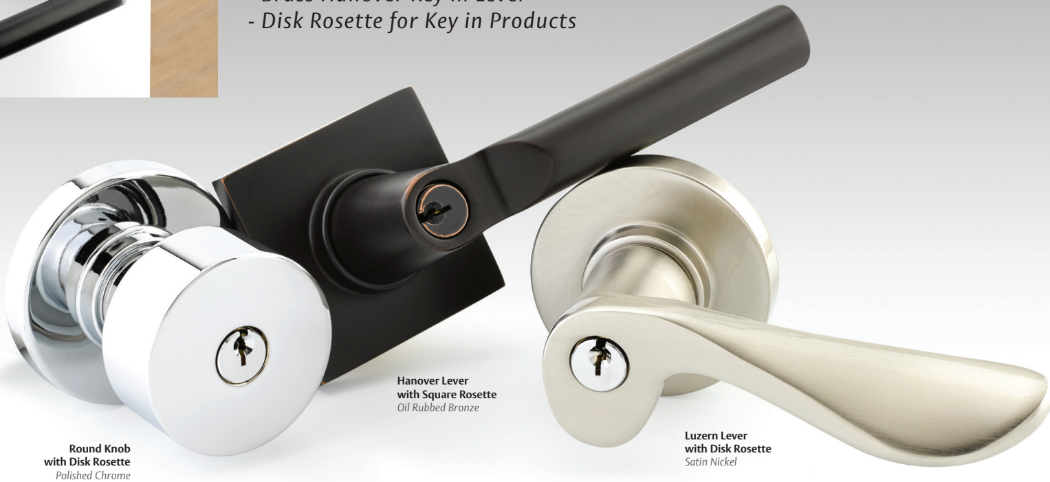
Round Knob with Disk Rosette Polished Chrome