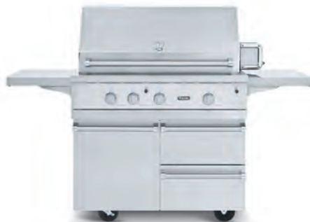
42"W. Outdoor Gas Grill* TruSear Infrared Burner Model Available