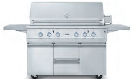
54"W. Outdoor Gas Grill* TruSear Infrared Burner Model Available