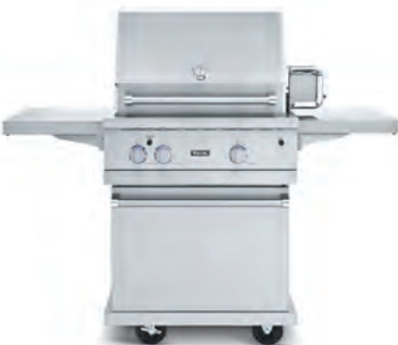
30"W. Outdoor Gas Grill*

Viking offers a complete line of outdoor products – transforming your backyard into a free range kitchen. Viking 500 Series grills elevate the art of barbecue to new heights, delivering unrivaled power and style to your backyard. A superior ceramic heat distribution system and powerful burners ensure every single filet turns out perfectly.