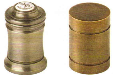
ALL Air Gaps