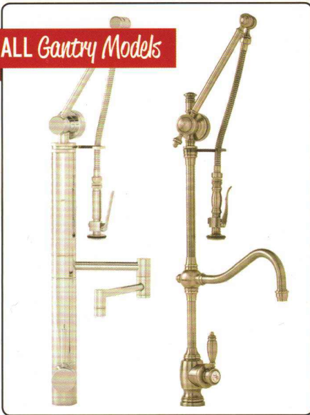
ALL Gantry Models