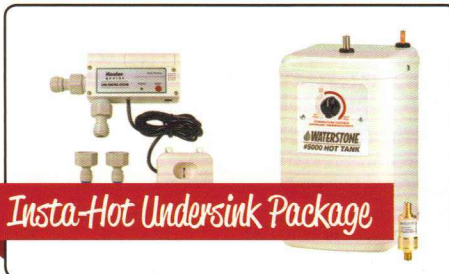
Insta-Hot Undersink Package