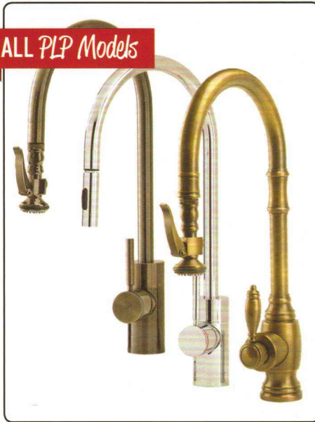
ALL PLP Models