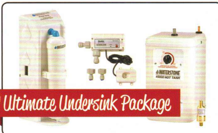
Ultimate Undersink Package