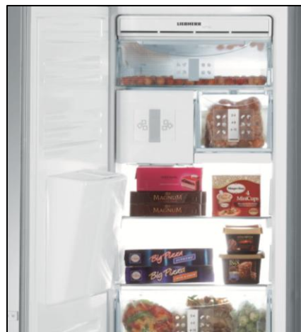
Close-up view of the two shelves behind the dispenser area and the very small space required for the ice maker.