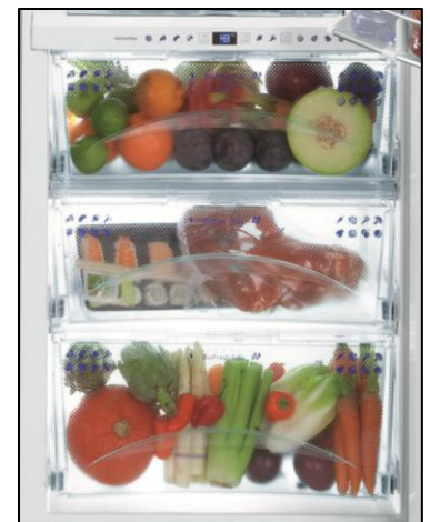
Introducing: BioFresh Plus™ see description below.

This unit is a first for Liebherr in the US, introducing Ice n' Water through the door. In addition we are introducing our patented BioFresh Plus™ technology. With its independent electronic control system, the temperature in three separate BioFresh Plus™ compartments can be adjusted from 28°F (best for storing fish) to 48°F (best for exotic fruits).